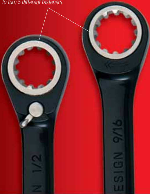
Spline box end offers the flexibility to turn 5 different fasteners