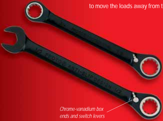
Chrome-vanadium box ends and switch levers

Proto ® Ratcheting Wrenches feature a spline ratcheting end to turn multiple fasteners while helping increase the force applied to the fastener. Spline tools engage the flats of conventional nut fasteners to move the loads away from the corner of the fastener and transfer them over a broader surface area.